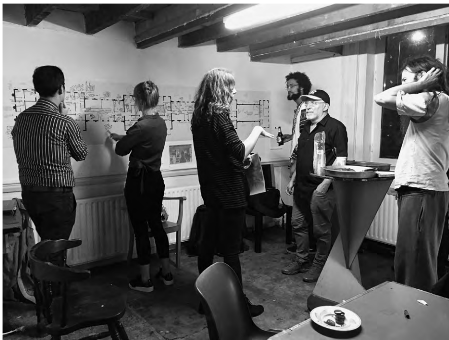
1 The first annotation session at Poortgebouw in Rotterdam, September 2017