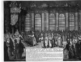
FIGURE 2.2 "L'audience donnée par le roy Louis XIV à l'ambassadeur de Perse ... 19 février 1715" (Receiving given by King Louis XIV to the ambassador of Persia ... 19 February 1715). Engraving, 44.5 cm x 16.6 cm.

"polite fiction" — a social scenario in which all participants are aware of a truth, but pretend to believe in some alternative version of events to avoid conflict or embarrassment Diplomatic Gifts and Emoluments: The Early National Experience ——— Robert Scaen Davis, Jr.* American diplomatic etiquette during the early national period culminated in large part in the domain of objects